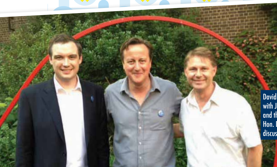
David Morris MP meets with James Wharton MP and the Prime Minister Rt. Hon. David Cameron MP to discuss Europe